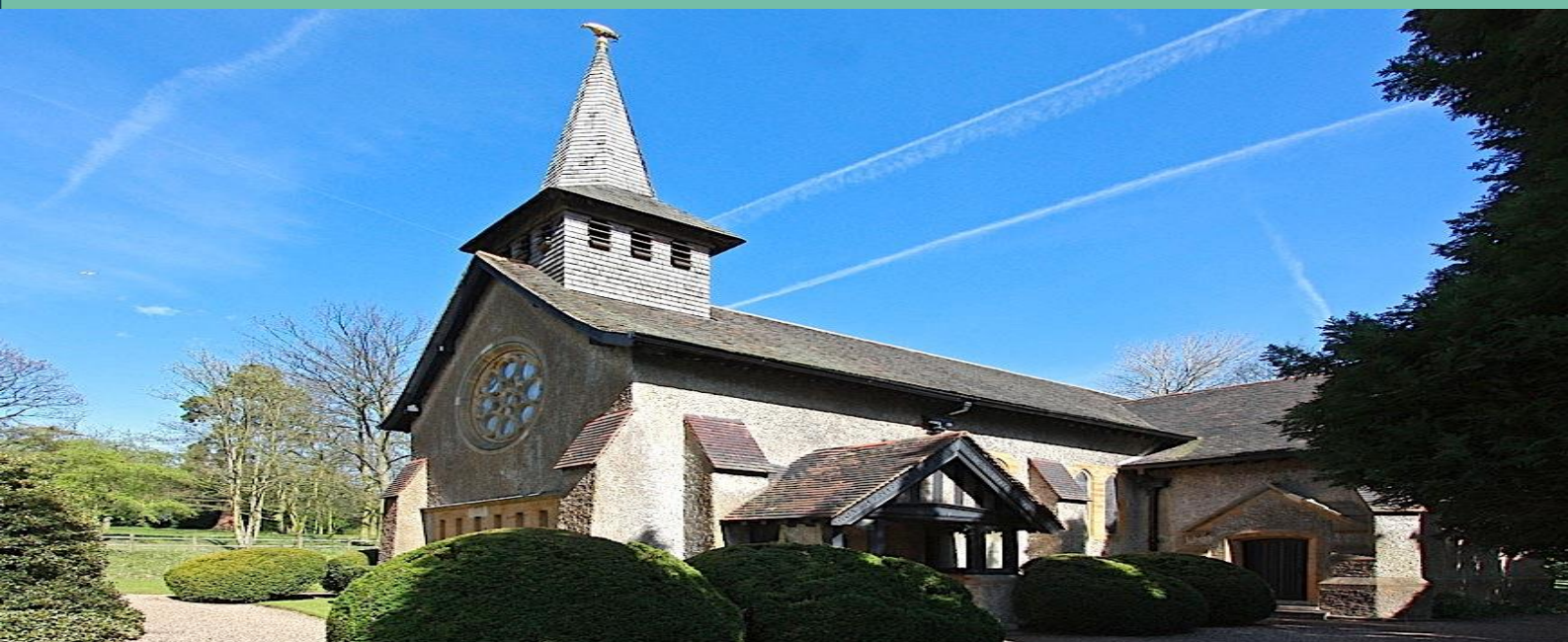
St Mary the Virgin, Great Warley