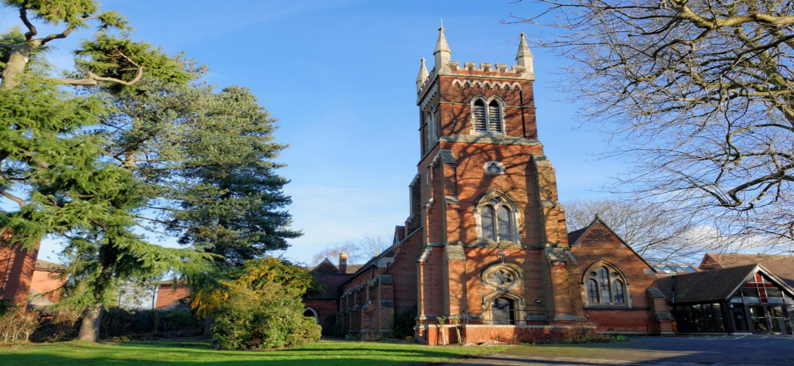
Christ Church, Warley